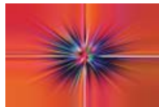
A Red Giant