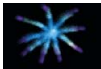
The Big bang